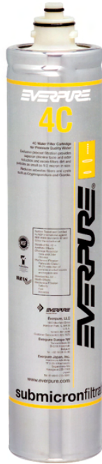
4C Replacement Cartridge: EV9600-00 (1-pack) EV9601-00 (6-pack)

Delivers premium quality water for cold cup vending applications