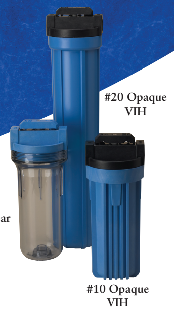
#10 Clear VIH