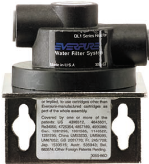
QL1 Single Head: EV9256-17

Filter head exclusively for Everpure replacement cartridges